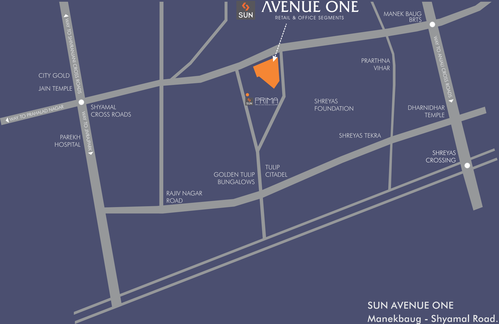
SUN AVENUE ONE Manekbaug - Shyamal Road.

“Right At The Junction”: What has been comfortably a peaceful residential locality, Sun Avenue One is placed right where The Residential area merges seamlessly into a busy commercial area. Starting from pre-shyamal cross roads and continuing in both perpendicular directions towards shivranjani on one side and the busy prahladnagar road on the other, this location gives you the best of ease and comfort while being so close and yet away from a chaotic zone.